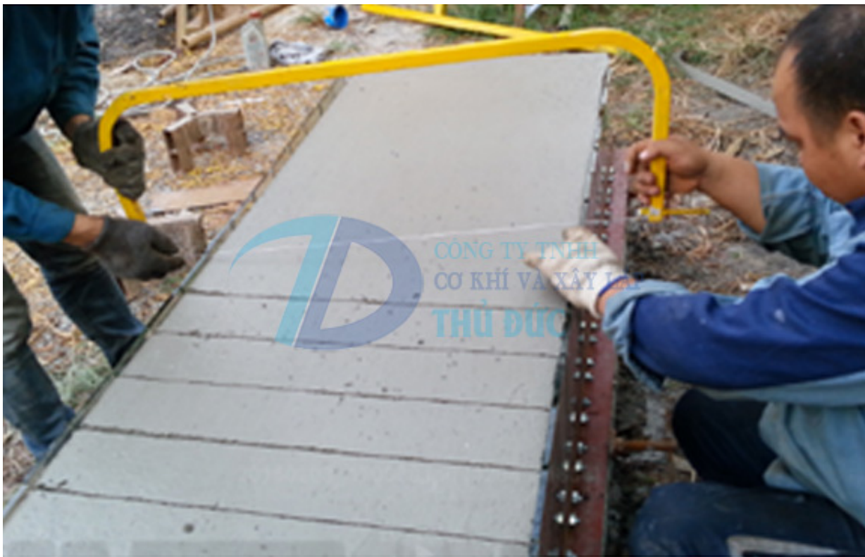
Brick after cutting: